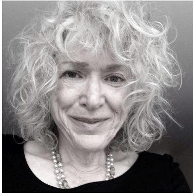
Joyce Wadler NY Times columnist, breast and ovarian cancer survivor Learn more about Joyce